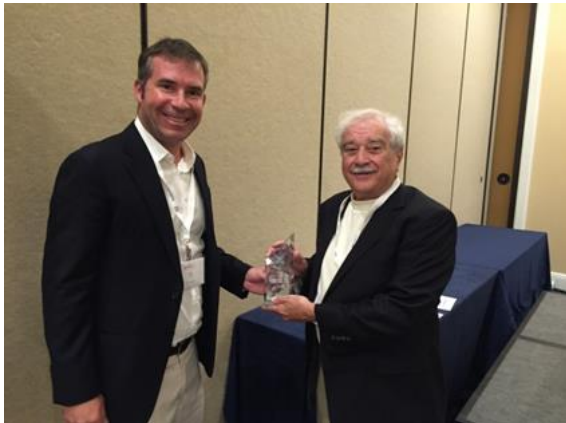
Pacific Corrugated Pipe accepting the 2015 Project of the Year Award.

water management, and caisson foundations. Our clients are the leading contractors, engineers and developers that work on private, municipal and state construction projects. We are committed to precision manufacturing, timely delivery, a knowledgeable team of fabricators, and project support. Our solutions utilize the most effective materials for each application, and are designed with durability and value in mind.