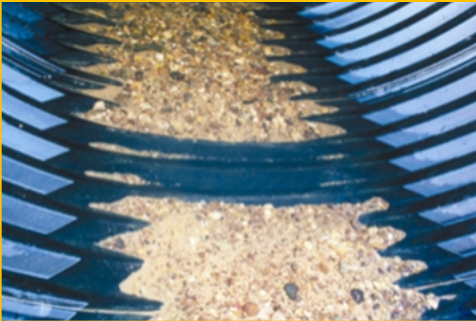
TRENCHCOAT protective film resists damage by sandy clay run-off and gravel, as well as acids, salts, and alkalines.

You can achieve additional abrasion protection by paving the invert either with asphalt, Portland cement concrete, or mortar, providing worry-free performance for even the toughest drainage applications.