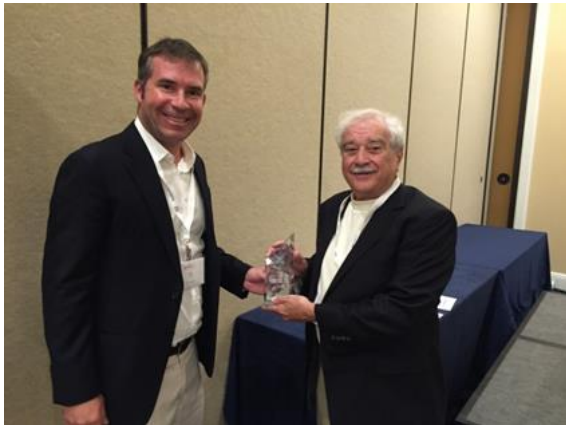
Pacific Corrugated Pipe accepting the 2015 Project of the Year Award.

water management, and caisson foundations. Our clients are the leading contractors, engineers and developers that work on private, municipal and state construction projects. We are committed to precision manufacturing, timely delivery, a knowledgeable team of fabricators, and project support. Our solutions utilize the most effective materials for each application, and are designed with durability and value in mind.